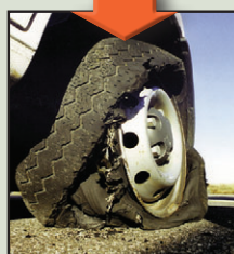
As a deflated tyre collapses, the wheel rim can come into contact with the road causing loss of control