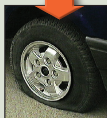
Tyron locks your tyre to the rim, forming a cushion of rubber so you can stay in control and drive to safety